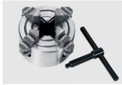
4-jaw chuck (independent) with flange