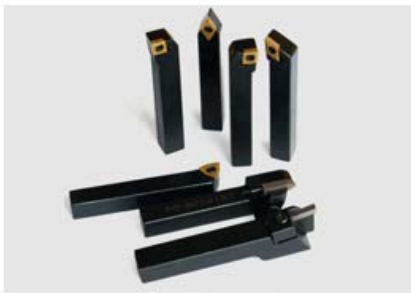
Cutter set (tips replacement)8x8 mm